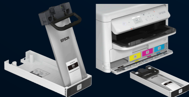
Designed for easy replacement of ink packs